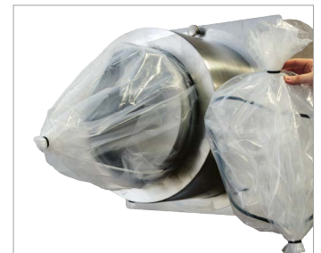
Cut the liner and dispose of the removed product