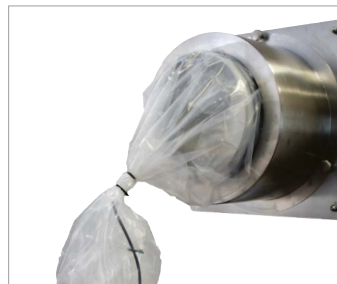
Close the liner